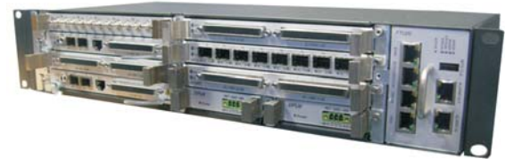
VCL-1400 - 7 Slot